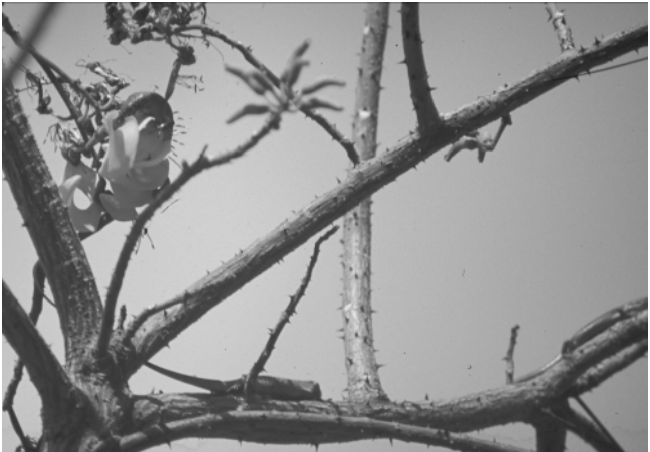
Fig. 2. Three Noronha skinks ( Euprepis atlanticus ) on the same mulungu tree ( Erythrina velutina ), the largest skink visiting the flowers (left) and the two lesser ones lingering on neighbour branches (below centre and right).