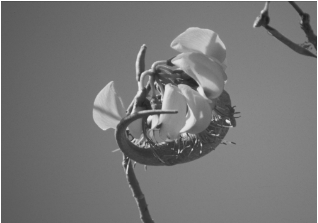
Fig. 1. A Noronha skink ( Euprepis atlanticus ) while exploiting an inflorescence of the mulungu tree ( Erythrina velutina ) at Fernando de Noronha Archipelago.