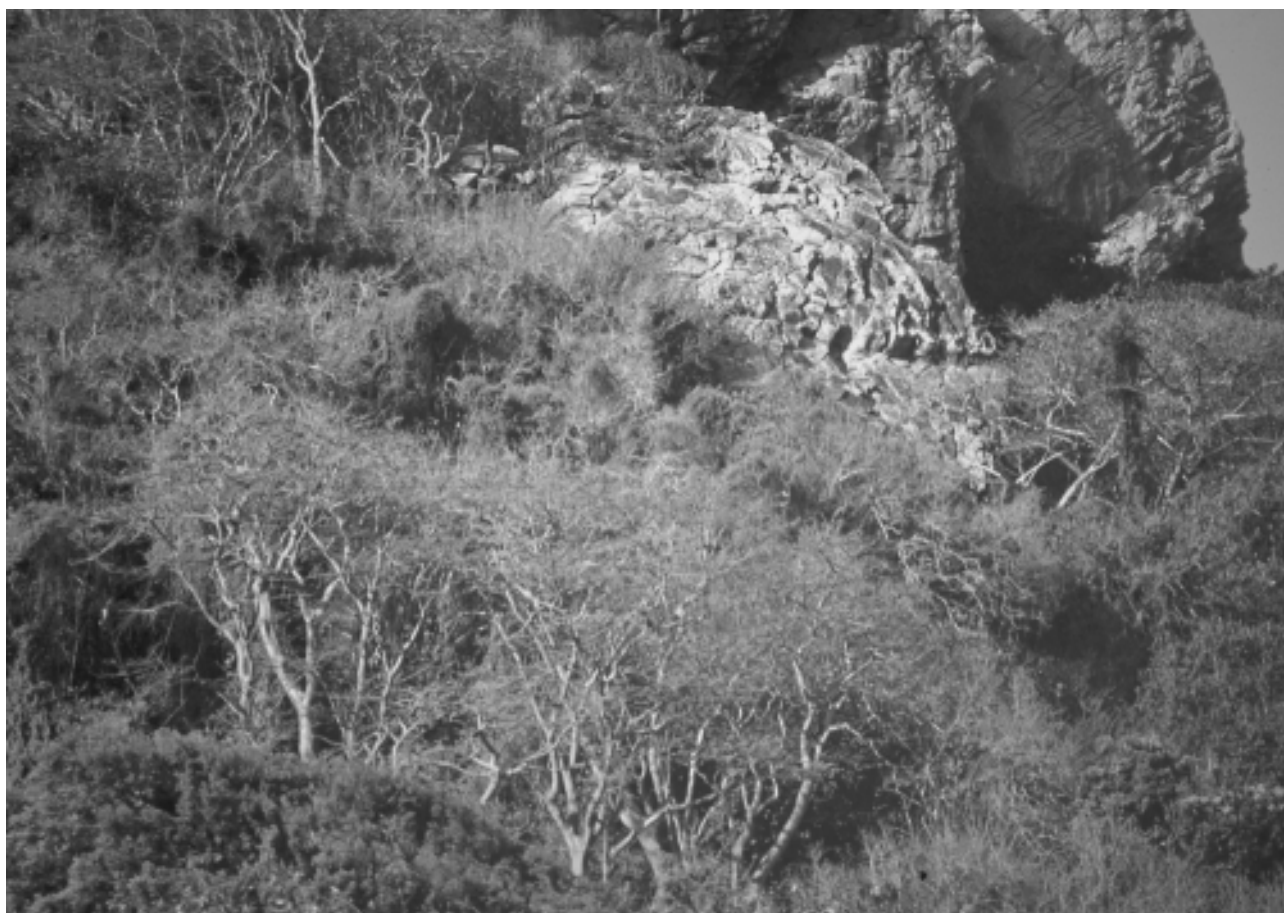
Fig. 3. A small group of blooming mulungu trees ( Erythrina velutina ) in the rocky landscape of Fernando de Noronha Archipelago.