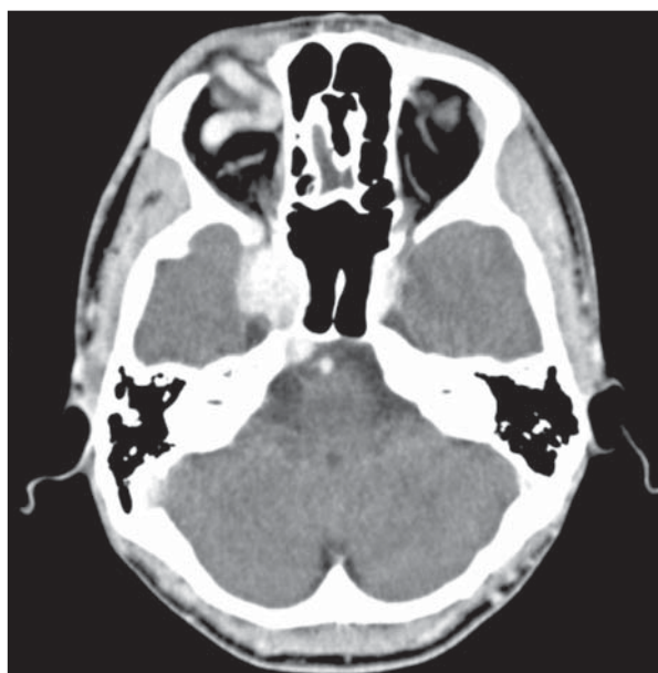
Figure 1. Axial enhanced head computed tomography (CT).

A 21-year-old male patient was complaining of right-sided pulsatile proptosis since five months, after head trauma.