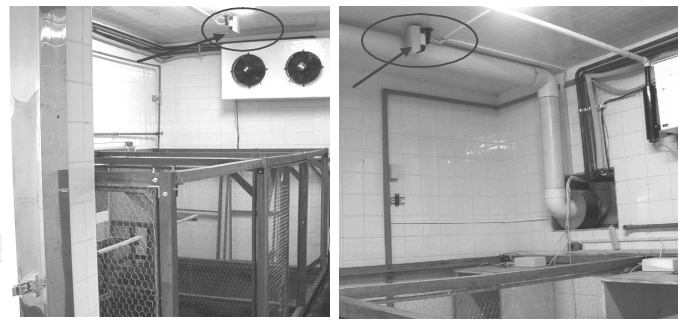
Figure 2 - View of the video camera placed in the geometrical center of the environmental chamber and the pens.

Recording of behavior: All behaviors described in Table 2 were continuously recorded by polychromatic video cameras installed on the upper part of the environmental chamber facing downwards, and on the upper part of the nests (Figure 2).