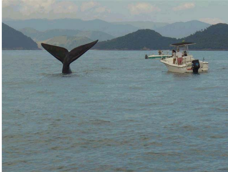
Fig. 12. Unsupervised approach to a female right whale ( Eubalaena australis) in São Sebastião and which could lead to collision and trauma for both observers and whale.