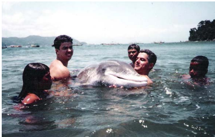
Fig. 8. A 250 cm long male rough-toothed dolphin ( Steno bredanensis ) with volunteers after its stranding on 28 December 1998 (CEEMAM-055), before it left the area.

• Tursiops truncatus (Montagu, 1821): Forty unpublished stranding records of bottlenose dolphins are listed in Table 6. A nearly complete T. truncatus skeleton was collected on the Praia da Juréia on 12 July 1986 (MZUSP-20382), but no further information was available. A male bottlenose dolphin, captured in Santa Catarina state (27°S) in 1983 for display at a small facility in São Vicente, was sighted in May 1994 in the southern waters of the SP coast after its release at the selfsame spot at which it was captured in April 1993. It was freeze-branded on both sides of its dorsal fin for tracking purposes. Subsequently it was observed in Cananéia estuarine waters (25°S) for at least two days (Fig. 9) and then it moved northwards to Santos (24°S), where it was frequently seen interacting with swimmers for three