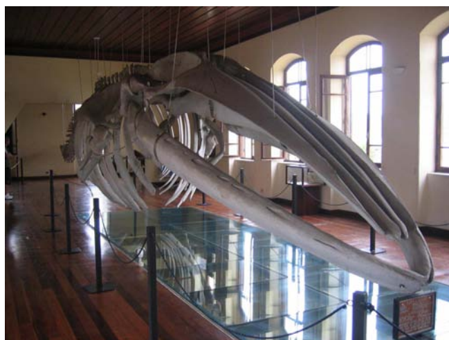
Fig. 2. An 18-m long skeleton of a fin whale ( Balaenoptera physalus ) found washed ashore at Peruíbe in 1941. It is on exhibition at Museu do Instituto de Pesca, Santos.

• Eubalaena australis Desmoulins, 1822: Two right whale tympanic bullae (MZUSP-2758 and 19837), collected in Iguape in 1902, were reported by Castello and Pinedo (1979). Sightings and strandings were recently updated by Lodi et al. (1996) and Santos et al. (2001a). A total of eight strandings were reported between 1936 and 2000 (see updated list in Santos et al., 2001a). Another stranding occurred on 15 August 2007, of a 4.5 m long male found at Itanhaém (CEEMAM-319). Most stranding records (67%) related to calves, three occurrences of which were related to individuals presenting vestiges of the umbilical cord.