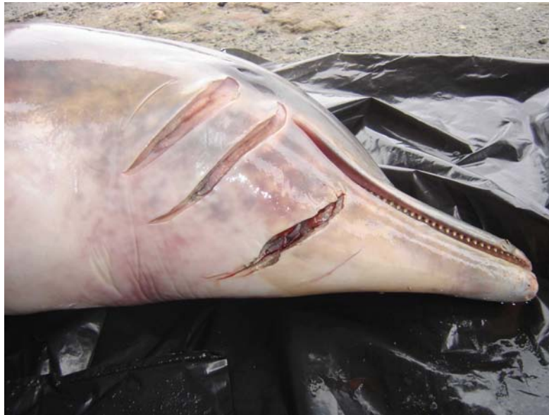
Fig. 11. Guiana dolphin ( Sotalia guianensis) found dead in Santos with fresh propeller marks which represented the main cause of its death.