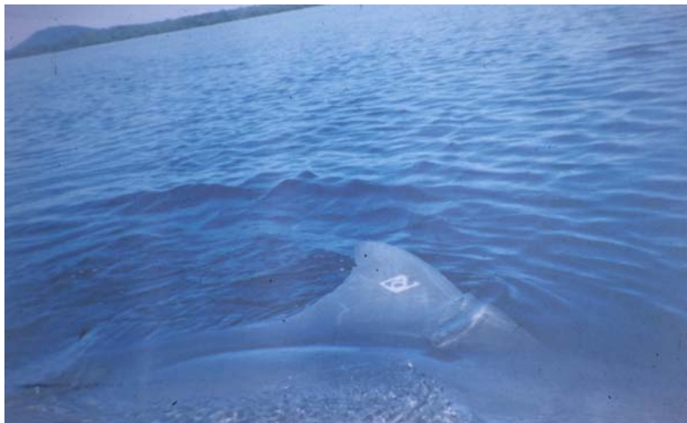
Fig. 9. Male bottlenose dolphin ( Tursiops truncatus ) named “Flipper” released from captivity in southern Brazil (27°S) in 1993 and found in April 1994 in the estuary of Cananéia (25°S). The Brazilian flag had been freeze-branded on its dorsal fin.