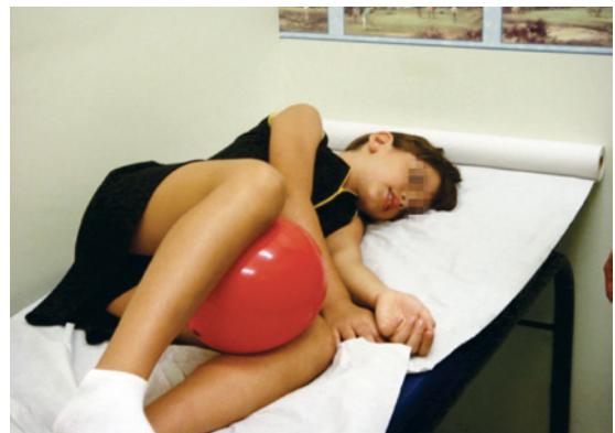
Figure 4. Abdominal muscles training