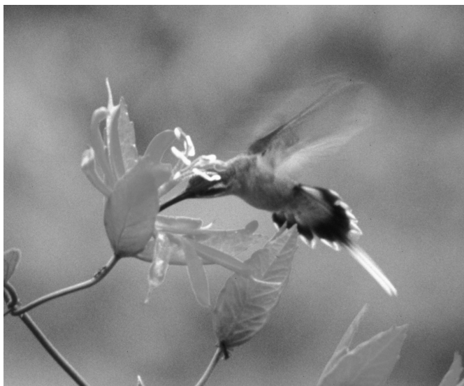
Fig. 1 — Phaethornis superciliosus visiting a bright red Passiflora coccinea Aubl. flower in the Central Amazon, Brazil. Note that the bill and the androgynophore lengths combine to determine the effective contact between the bird's head and the sexual flower parts.

Phaethornis superciliosus was the only hummingbird recorded visiting P. coccinea flowers, although other hummingbird species occurred at the study site. Its visiting activity started between 0530 and 0600 h and finished when the flowers stopped nectar secretion. Individuals of Ph. superciliosus drank almost all the nectar from the flowers before leaving a plant; we found no nectar in the flowers just after visiting bouts. During a visiting bout, a hummingbird commonly visited all flowers of a plant and probed each flower more than once, by inserting the bill in different parts of the nectar chamber. The number of hummingbird probes per flower per visiting bout was 3.1 \pm 1.5 ( n = 36 ), and the cumulative number of probes per flower at the end of its lifetime was 16.1 \pm 5.3 ( n = 8 ). Daily, one or more Ph. superciliosus (we were unable to determine how many birds visited the plants) made 9-11 visiting bouts per flowering plant, with intervals averaging 18.3 \pm 8.3 min ( n = 13 ) between