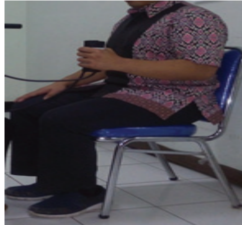
Fig. 1 Modified Sphygmomanometer

socioeconomic factor. Higher socioeconomic status implies higher income and is associated with better education, resulting in better nutrition, better child care, and better medical and social services. 7