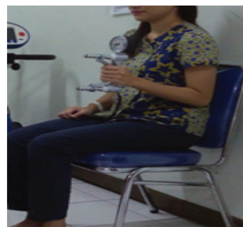
Fig. 2 Modified Sphygmomanometer