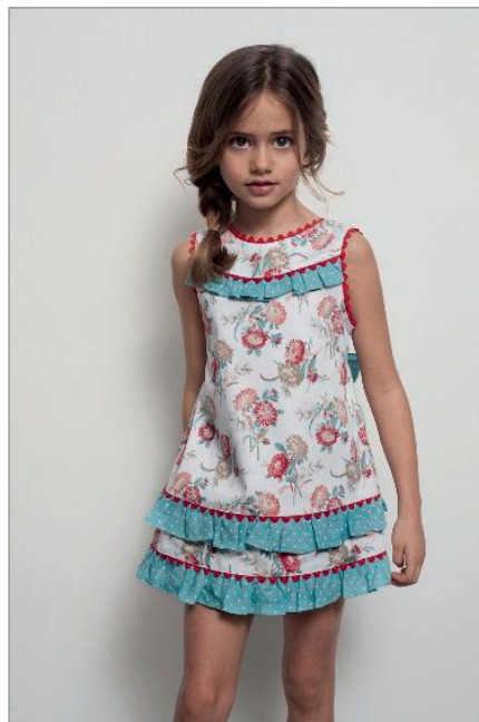
Image 2. Non-sexualized image