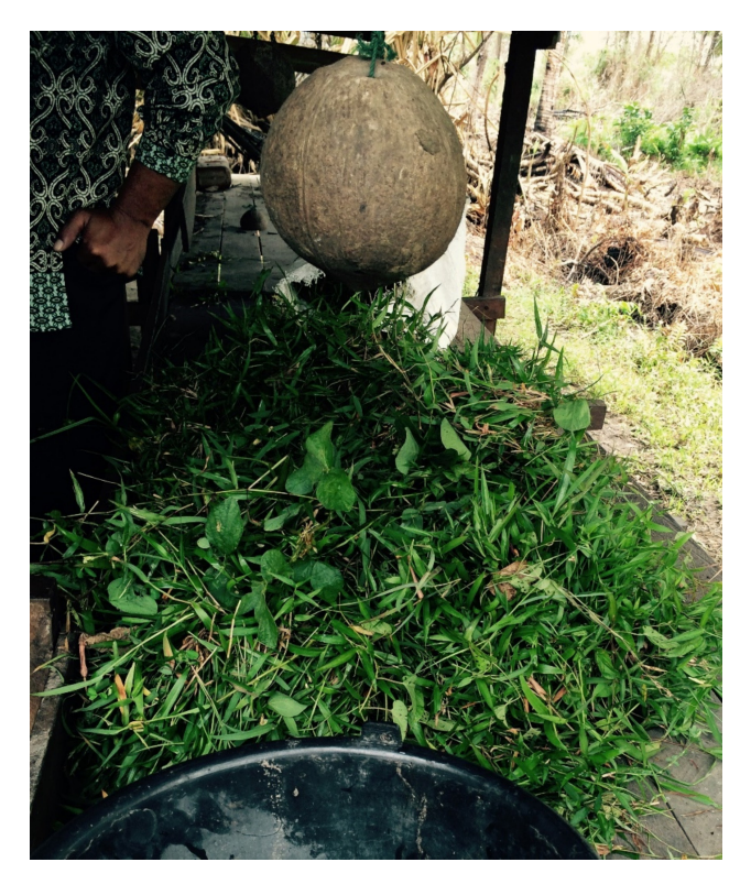
Fig. 2: Coconut saltshaker

penned goats. As an alternative to adding salt to the water, goat owners created a coconut 'saltshaker' suspended above the cut and carried foliage so goats may head butt the shaker and deliver salt to their taste (Figure 2).