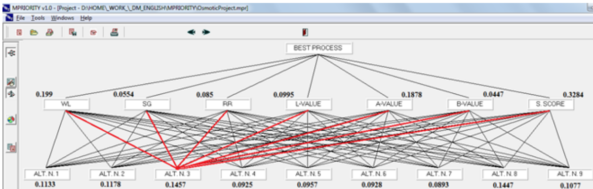
Figure 6: Hierarchy of decisions corresponding to the problem of choosing the most preferred osmotic dehydration process; the main goal (BEST_PROCESS) is set at the top of the hierarchy; the decision alternatives ALT.N.1-ALT.N.9 are at the bottom (see Table 10); the criterion of the decision problem (i.e. water loss (WL), solute gain (SG), rehydration ratio (RR), L-value, a-value, b-value, and sensory score(S.SCORE)) make up the middle of the hierarchy.