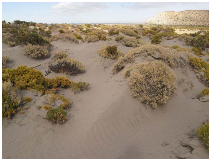
Figure 7. Dunes in Península Aristizábal.