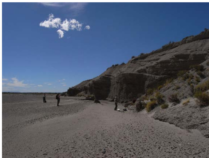
Figure 5. Section in marine deposits along the Cañadón Malaspina.

high concentration of organic material. Generally they are covered by typical halophyte plants.