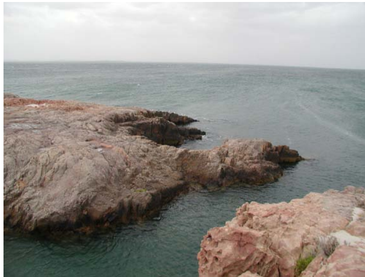
Figure 2. Rocky shore platform in the Península Gravina.

The low amount of precipitation (<300 mm/yr) and moderate thermal amplitude allow the growth of a sparse cover of grass and shrubby vegetation, consistent with the semi-arid climate of Patagonia. The oldest rocky substrate, Complejo Marifil, consists of Jurassic rhyolites, ignimbrites and volcanoclastic conglomerates. It is often covered by thin to very thick debris deposits and crops out basically in current and paleo rocky shore lines, islands and cliffs (Figure 2).