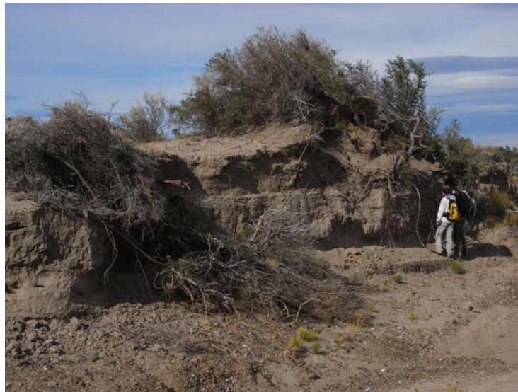
Figure 6. Stabilized dune covers fluvial deposits in Cañadón Restinga.