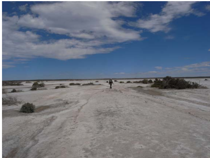
Figure 4. Salitral near the village in Bahía Bustamante.