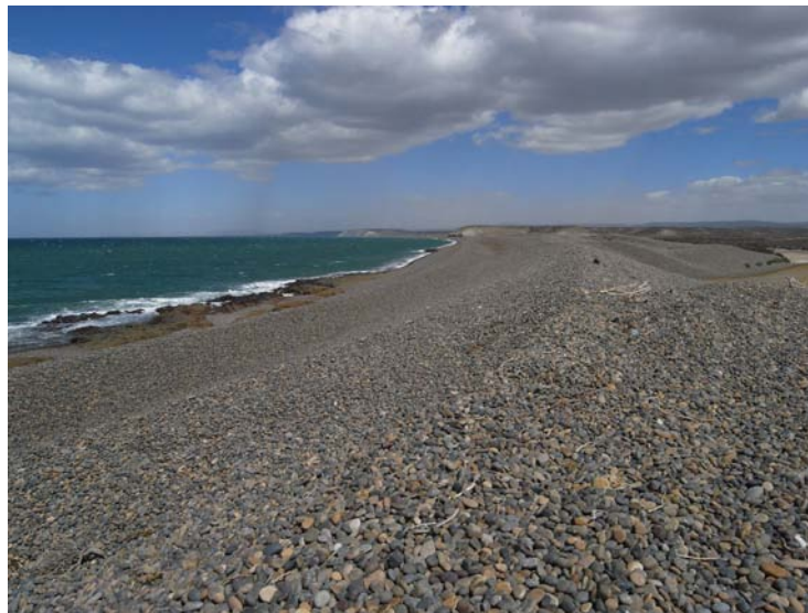
Figure 3. Holocene Beach ridge series in Península Aristizábal.

metres thick to series of relict forms that are very large and thick. These latter may extend several kilometres inland rising to more than one hundred metres above current sea level. These deposits may occur in singular form often dissected by fluvial erosion, or as sets characterised by crests located at the same elevation (Figure 3). Their curvature varies from almost straight (in the higher and older forms) to very curved, tracking the variation of the shoreline geometry in time.