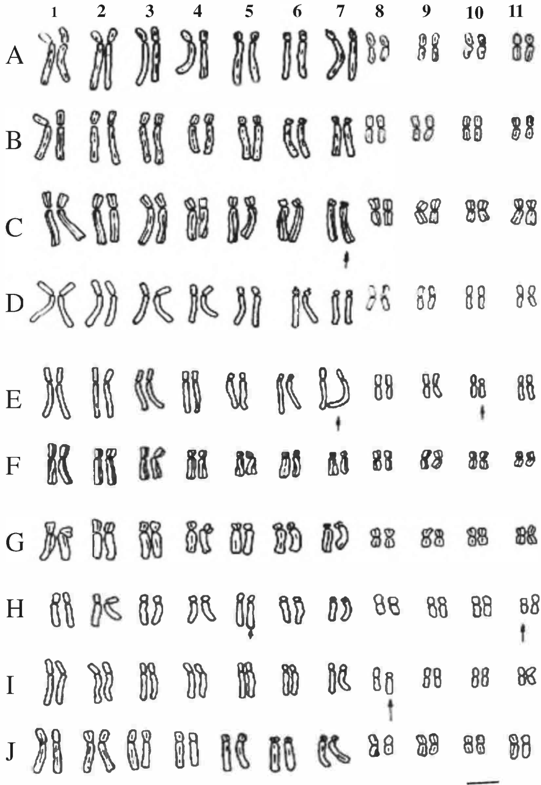
Figure 5. Karyograms of Hippeastrum spp. A, H. morelianun . B, H. correiense . C, H. parodii . Arrow shows a pericentric inversion in a long chromosome. D, H. rutilum . E, H. tucumanum . Arrows indicate a reciprocal translocation between a short and a long chromosome. F, H. psittacinum . G, H. evansiae . H, H. argentinum . Arrows indicate a reciprocal translocation between a short and a long chromosome. I, H. hybrid . Arrow shows a pericentric inversion in a short chromosome. J, H. solandriiflorum . Scale bar, 10 \mu m.