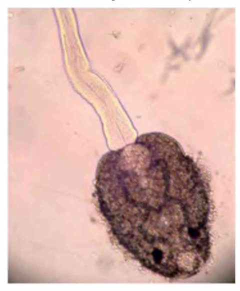
Fig. 3. Paramphistomum sp. cercariae showing characteristic main excretory vessels disposition.

The cercariae emerge from their rediae and undergo a maturation period of approximately 10 days, within the snail. These cercariae have pigmentation and 2 eye spots, and in this phase, a typical feature of ruminal paramphistomids, the crossing of the main excretory vessels (Durie 1951, 1956; Yamaguti, 1958; Sey, 1991) (Fig. 3).