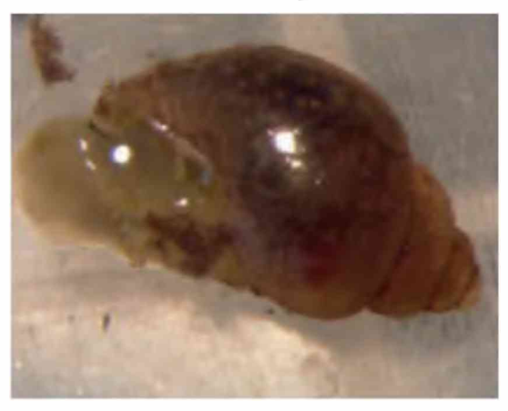
Fig. 2. Lymnaea viatrix snail.

In Argentina, Lymnaea viatrix (Venturini, 1978) (Fig. 2) and L. columella (Prepelitchi et al. 2003) have been described as intermediate hosts of Fasciola hepatica, and several species of the genus Drepanotrema and Biomphalaria are also present in the local snail population (Rumi et al., 1997). At the moment, L. viatrix seems to be more receptive intermediate host to Paramphistomum sp. (Sanabria et al., 2005), although role of planorbids has not been discarded, since there are enough evidence around the world of their participation as intermediate hosts of these paramphistomids in ruminants (Sey, 1991).