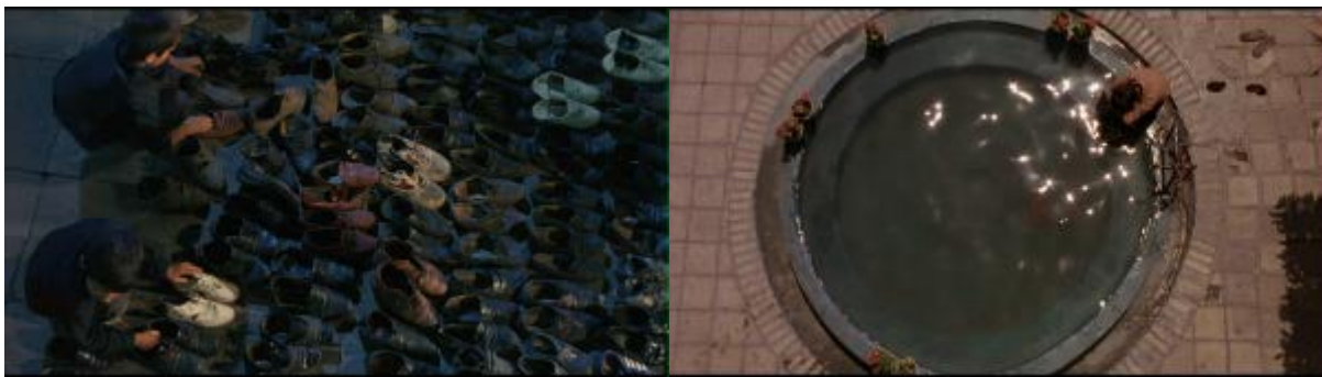
Figure 3: Overhead supervisor point of view in Children of Heaven (source: picture of original frame of film)

distributing teas during the ceremony at mosque. Ali pairs the shoes with no pause; although he and his sister need just one pair of shoes. Another scene is in final shots of the film, where Ali returns home from the race and he is then shown dipping his bare blistered feet in a pool. The two overhead views can have implied meaning for the audiences that is a supervisor and viewer in the skies (overhead) that controls actions of characters (figure 3).