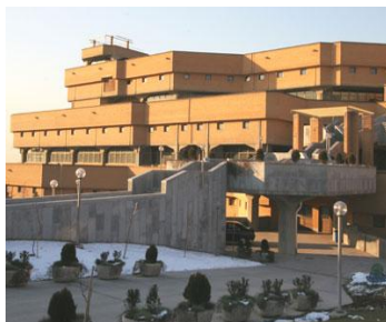
Figure 4. National Library building

The building was opened in 1383 in the hills of Abbas Abad, Tehran. Consulting Engineers expressed the important factors in shaping the project in the following way: