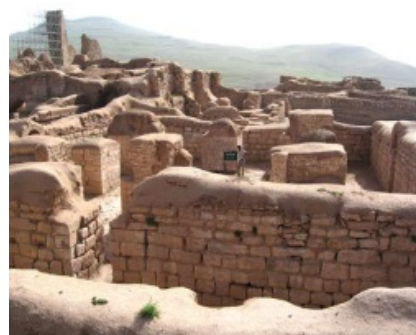
Figure 2. Throne of Solomon

The complex of the Throne of Solomon is located in the north of Takab City and southeastern o Urumia Lake in Western Azerbaijan province. It is on a platform and natural rock to a height of twenty feet above the plain, which is generally composed of layers of sediments of the lake.