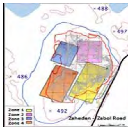
Figure 3: Zoning based on the formation of cities, similar spaces and deploying the applications during development (author, 2013).