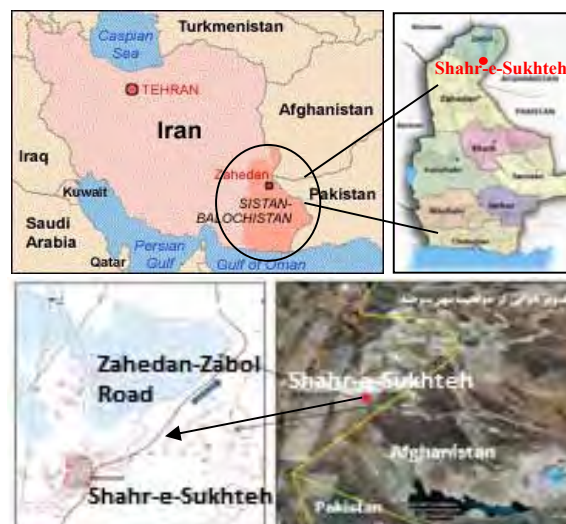
Figure 1: The bed and limits of the region under the study

Burnt City is the name of the ancient city ruins located 56 km away from the city of Zabol in the north of Sistan and Baluchestan province (Sarani, & Rezaszadeh, 2011) (Figure 1).