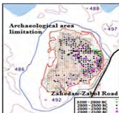
Figure 2: the periods of artifacts based on Remote Sensing data and determining the ancient region borders (Mortazavi, 2007).

Zone 3: (industrial area): The zone is located in the northwest of the hills and its area is 25 hectares. The archaeological ruins founded in this zone are dating to 2500 BC. Clay sewer pipe in the trench are among the most important discovery in this zone. The industrial area in this zone and its great view to the plain landscape and the dry bed of the lake are among the most important discovery in this ancient site. This area is separated from the zone 4 by a hole.