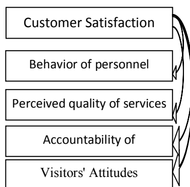
Figure 1. Customer Satisfaction Model