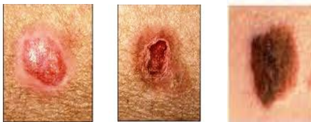
Figure 1: Basal cell, Squamous cell and malignant Melanoma

Skin cancers can divide into different types including Basal cell, Squamous cell and malignant Melanoma, which the later is the most deadly type (See Fig.1). However, if diagnosed in early stages, it can be treated.