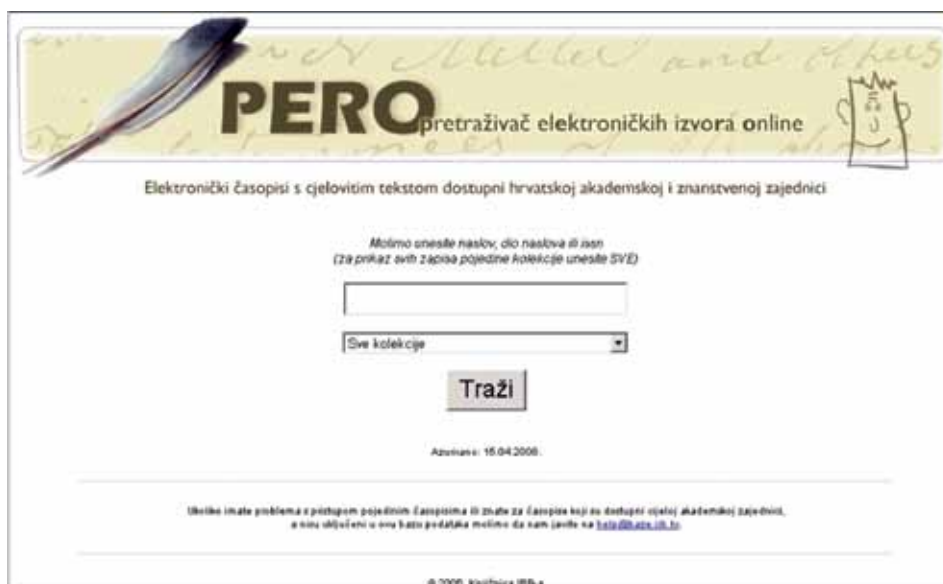
Fig. 5. PERO – browsing screen