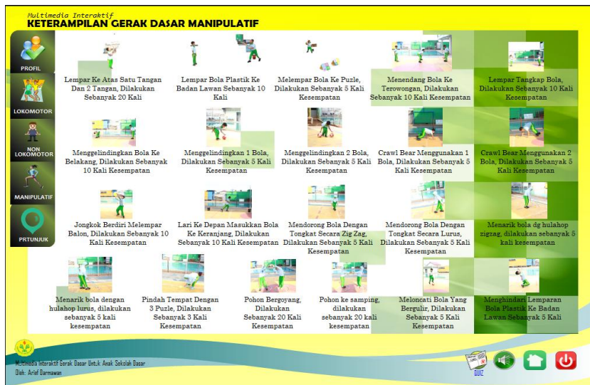
Picture 4. Manipulative Basic movement Display Menu

On the basis of the manipulative movement menu there are 22 models available, to see and study the related models users click on each image or text models.