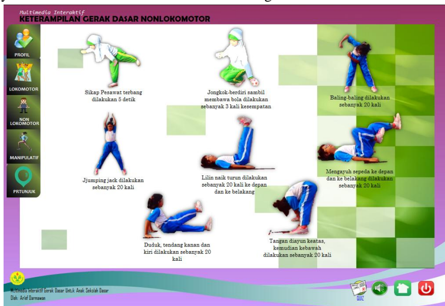
Picture 3. Non-locomotor Basic movement Display Menu

On the menu basic locomotor movements there are 17 models available, to see and study the related models users click on each image or text models.