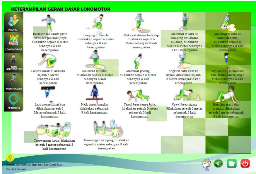
Picture 2. Locomotor Basic movement Menu Display

served a variety of learning models Geran non-locomotor so did the menu manipulative, while the menu instructions presented operating instructions as well as eBook models of practice overall.