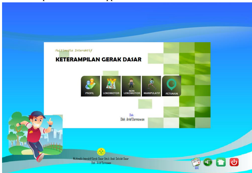
Picture 1. Main Menu Display

Here are the results of the development of interactive multimedia product after all material processed in one application: