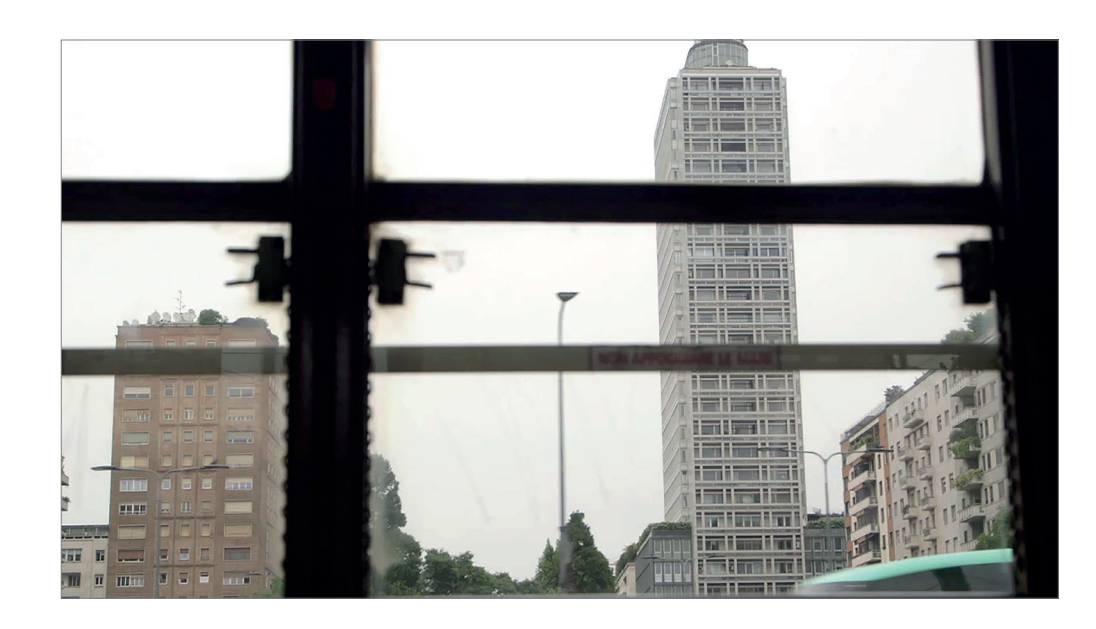
Fig. 5 - Framing and mapping the city in "Tre Milano" (2015), Silvio Soldini.

rects our gazes outside up to the wires that connect the city, and down to street level, the film unfolds Milan's material architectonical history, its urban design and transformation. The cranes signal a city under construction, while the city-scape depicts a past that seems to live in an accepted equilibrium with the present, dignified historical buildings coexist with post-war apartment buildings and the new recognizable skyscrapers (from Torre Velasca to the Bosco Verticale). It is a filmic map captured through the frames of the tram window and accompanied by the rhythmic sound of the tram-wheels on the rails ( fig. 5 ).