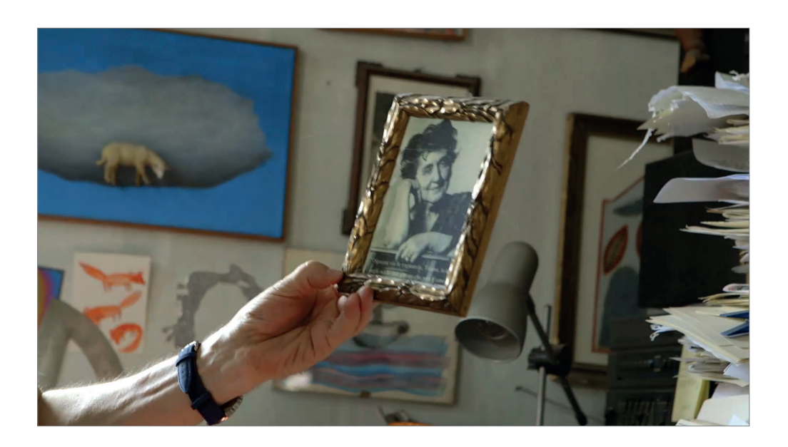
Fig. 9 - Cradling objects in "Il fiume ha sempre ragione" (2016), Silvio Soldini.

That same ethos and passion they dedicate to their art governs every aspect of their lives. Not always focused on the task at hand, Soldini's camera occasionally wanders among the objects and pictures in Alberto's and Josef's studios, objects occasionally picked up and held out toward us, cradled in their hands like old friends ( fig. 9 ). Only occasionally we take a break from this creative activity to observe Josef's city from above or to walk along Alberto's river, the river that evokes an aphorism that becomes the title of the film, the river is always right, an acknowledgement of the natural order of things, of flow and slowness ( fig. 10 ).