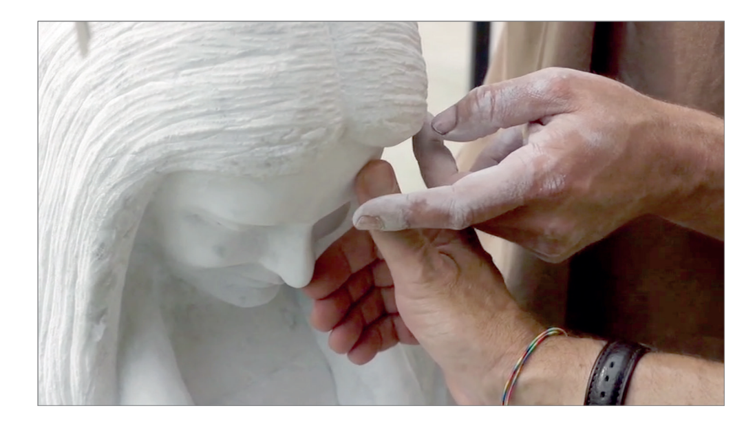
Fig. 1 - Seeing differently in "Per altri occhi" (2013), Silvio Soldini.

The nature of the subject the film explores and of its protagonists mean that Soldini and Garini also embrace different strategies in their filming. In contrast to their previous documentaries, where they remained diegetically "outside", Soldini and Garini modestly enter the film itself, through their responses to questions or requests heard offscreen and the visual intrusion into screen space - their assisting in a sailing manoeuvre that almost causes a capsize, Soldini's fingering Felice's sculpture as he himself experiences "seeing" differently through this active touching (fig. 1). The words (which reach us aurally) or gestures from the margins of the frame break one of the codes of traditional observational documentary that keeps the director outside the text. At the same time this breaking of the code is humbling and levelling; it disrupts the hierarchy between filmmaker and filmed subject and creates the level of intimacy required to enter the protagonists' physical and psychological spaces.