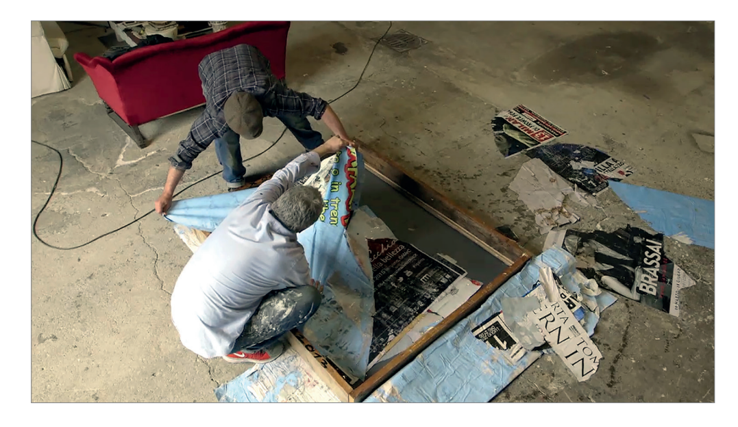
Fig. 6 - Recycling images in "Tre Milano" (2015), Silvio Soldini.

their transcultural issues as they hope for a more tolerant and less racist society. Kirba cycles to one final spot, the Ciclofficina Stecca, in the Isola quarter of Milan, in the shadow of the reflective Unicredit tower and at the end of the road for tram 33. Here the workmanship, creativity and industriousness that is part of the city's history endures as she joins others who want to learn to repair their own bicycles but also to build things with their hands, sawing and sanding pieces of wood destined for use.