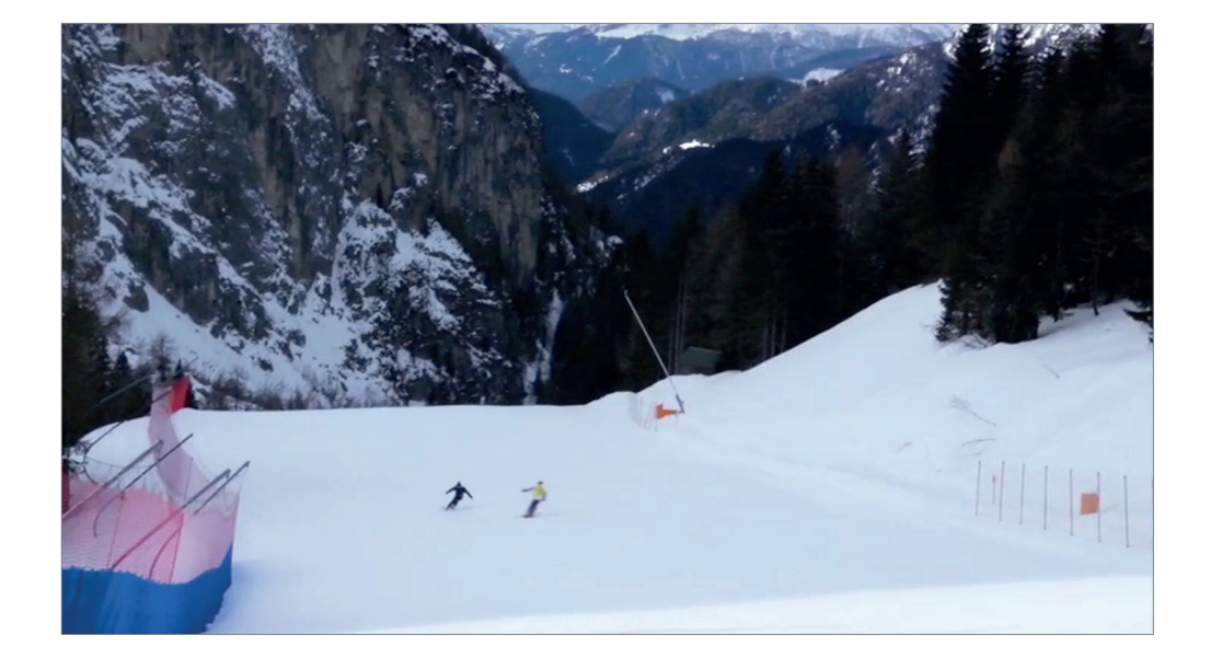
Fig. 3 - Emotion experienced haptically in "Per altri occhi" (2013), Silvio Soldini.

instructor distancing himself from us visually, and we watch him in that imposing landscape, in the blinding white snow. Despite our increasing visual detachment, we can still hear the orienting cries of his instructor, and feel the great sense of liberty that soaring down the mountain allots ( fig. 3 ). This, like so many other scenes in Soldini's film, is one of pure emotion, experienced haptically, transferred from the skin of the screen to the body of the viewer.