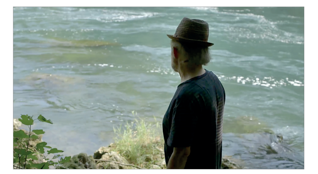
Fig. 10 - Flow, slowness and the natural order of things in "Il fiume ha sempre ragione" (2016), Silvio Soldini.

The gaze does not depend only on the eye, but on all the senses. There are images that should be listened to more than looked at, others that cry out that we touch them, immerse ourselves in them, images that invade us and fill us, that move us, that make us think. The eye in the end does nothing more than find the best image for what the gaze "sees." It searches for a form, a movement, a music to recount that image, something singular and unutterable.<sup>34</sup>