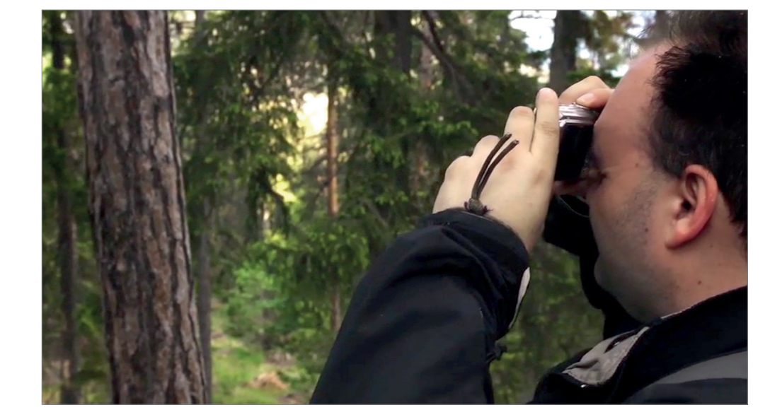
Fig. 2 - Intuiting the image in "Per altri occhi" (2013), Silvio Soldini.

lice to comfortably navigate a previously unfamiliar city, or Giovanni to find his pair of socks and Enrico to remember an old home through the smell of dampness. Pure memory comes to us in less structured, non-habitualized forms, unexpectedly, when we recall something unrelated to our present situation, perhaps in a state of sleeping or daydreaming, like the memory of the blues and greens of a panorama that unexpectedly come back to one of the protagonists and that thus allows him to see the colours he can no longer "see".