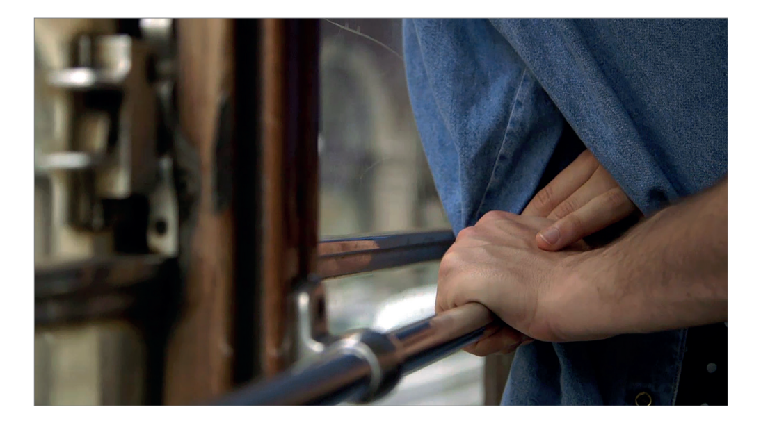
Fig. 4 - The affection of intertwined hands in "Tre Milano" (2015), Silvio Soldini.

and intolerant Milan of Anima divisa in due ; and, following a break, the Milan of the depressed economic years in Cosa voglio di più ( Come Undone , 2011), a city of hour motels and claustrophobic interiors. In Tre Milano , we traverse the contemporary changing landscape of the urban metropolis, a city like Calvino's invisible city of Zaira cited at the beginning of this section, that contains its past, its present and its future in its materiality.