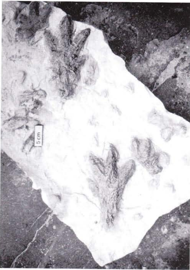
Fig. 2 - New specimen of Anomoepus pienkovskii Gierlinski, 1991 (Muz. PIG 1662.II.1) from the Hettangian of Giliany Las (Poland), which was left during a plantigrade gait. Scale bar = 5 cm.

erally smaller dimensions, but divarication angles II-III and III-IV are similar to those of Anomoepus scambus Hitchcock, 1848 ( 35^\circ , 23^\circ ). Among the Northern Hemisphere anomoeopodids, the most similar form is Anomoepus pienkovskii Gierlinski, 1991 from the Lower Jurassic of Poland. However, Polish Anomoepus tracks have a more robust general structure with the shorter metatarsal imprints, which appeared in the new discovered specimen Muz. PIG 1662.II.1 (Fig. 2).