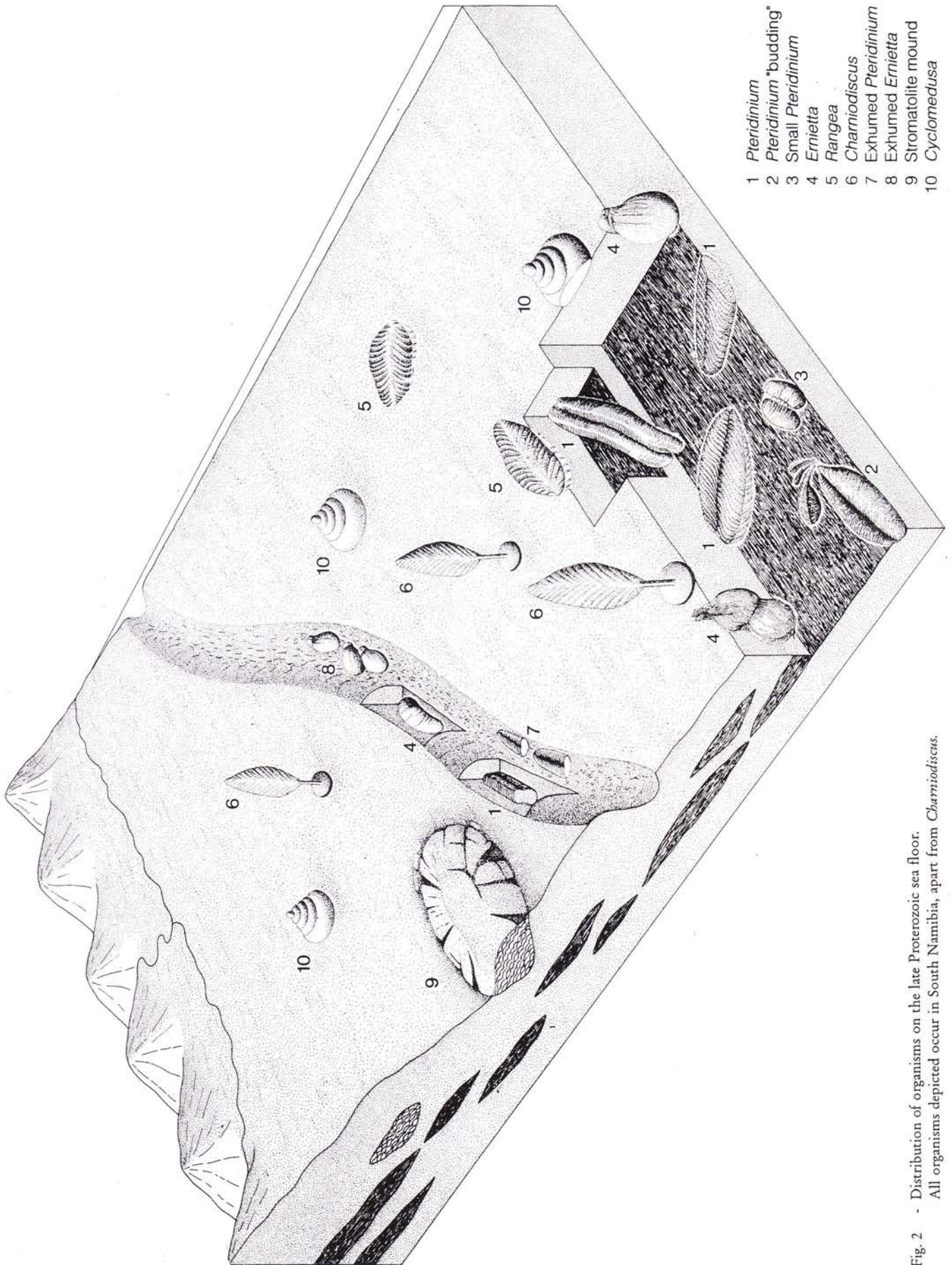
Fig. 2 - Distribution of organisms on the late Proterozoic sea floor. All organisms depicted occur in South Namibia, apart from Charmiodiscus .