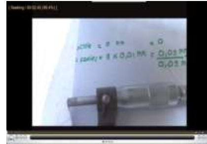
Figure 2. Concept about how to of result measurement