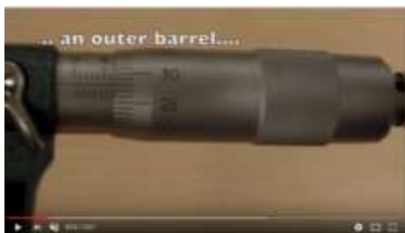
Figure 4. The Component of Micrometer