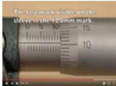
Figure 1. The concept about how calculate to read of measurement