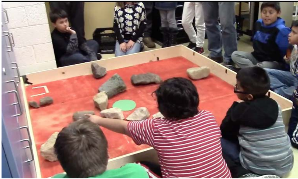
Figure 2. Mars simulator for students' robot and coding project.

Coding achievement of students was evaluated using two methods: The first test was the evaluation of students' coding project and the other was a test on code.org. The final project was to individually code a robot to reach a fountain on Mars (see Figure 2). Students' final projects were evaluated using a rubric (see Table 1) by two researchers and the mean score was adopted as one of the coding achievement scores.