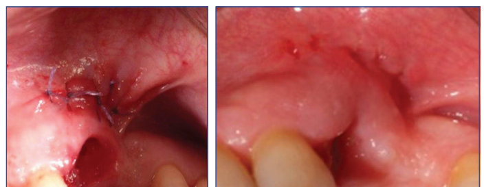
[Table/Fig-5]: Surgical view: the sutured wound.