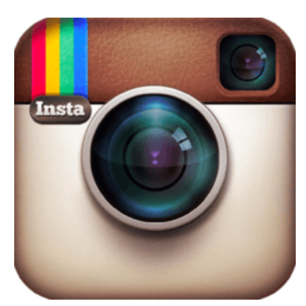
Insta-emblems CC BY-SA

Nowadays it is Instagram and Facebook that satiate our taste for short messages that play on a picture. In the same way that the likes of Scève's unicorn helped previous generations grasp the bigger questions, such as the passing of beauty or the inevitability of death, Instagram postings will often be musings on the nature of the lives we lead. It seems that there is something eternal at work, something beyond profits and price tags. Then, now and always, decipher these messages and we can solve life's imperfect vision of reality.