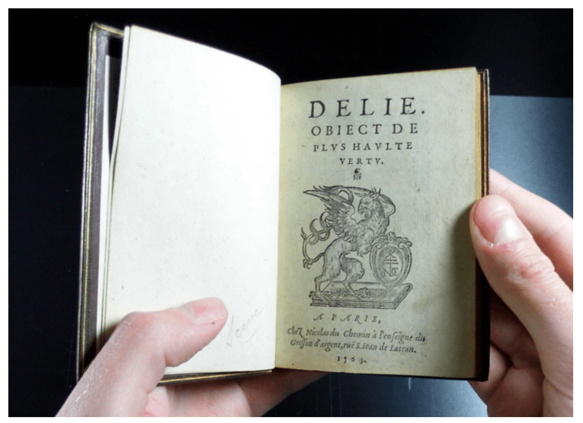
The missing link University of Glasgow

The university was willing to drop other priorities to make the five-figure investment because Délie was the only gap in the Stirling Maxwell Collection – the biggest collection of emblem books and related literature in the world. The collection contains some 2,000 volumes – far beyond nearest "rivals" like Princeton and Illinois which have about 700 each.