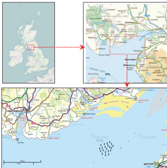
Figure 1 Location of Kirkcudbright and the Robin Rigg wind turbine array in the Solway estuary, South-West Scotland (Map images. © Crown Copyright and Database Right 2015. Ordnance Survey (Digimap Licence)).

The Robin Rigg wind turbine array, the first commercial offshore wind farm in Scottish waters, is situated in the Solway estuary, mid-way between the Galloway coast, South-West Scotland, and the Cumbrian coast, North-West England (Fig 1). The centre of the turbine array is approximately 11 km from the Dumfries and Galloway coastline and 13.5 km from the Cumbrian coastline. With a generation capacity of 180MW the Robin Rigg wind farm is the largest in Scotland, consisting of 60, 125 m high, V-90 3MW Vestas turbines (E.ON, 2014). Each turbine is supported on a monopile foundation which typically extends 30 to 40 m into the sea bed, in shallow waters of between 4-13 m deep (4C Offshore, 2014).