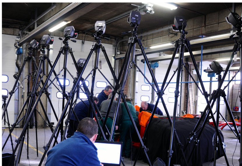
Figure 2 Setup of vehicle and cameras for the extrication scenarios.

Control measurements were taken from the participants during self-extrication under verbal instruction with no collar and the mean cervical spine movement for all participants was 13.33°