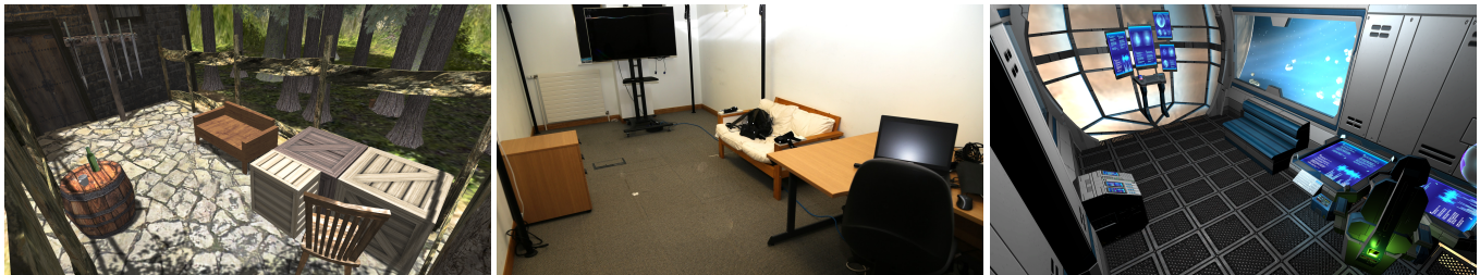
Figure 1. Two Virtual Environments based on the layout of a real room (middle): a medieval courtyard (left) and the bridge of a spaceship (right). In these Substitutional Environments , every physical object is paired, with some degree of discrepancy, to a contextually appropriate virtual object.

* Lancaster University Lancaster, United Kingdom