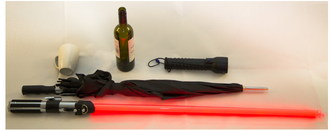
Figure 3. From left to right, top to bottom: the real mug and wine bottle used as physical props in the first study; the torch, umbrella, and Force FX replica of Darth Vader’s Lightsaber used in the second study.

Overall, we found that the objects that participants thought detracted from their suspension of disbelief were those that had a different shape or temperature. We found significant differences for the box ( M = 2.91 , SD = 2.19 ), the sphere ( M = 2.5 , SD = 1.24 ), the Hot mug ( M = 3.81 , SD = 2.32 ), and the Icy mug ( M = 4.21 , SD = 2.04 ). The Small mug ( M = 2.86 , SD = 1.75 ) was found to be less believable, while the bigger one was not. No significant differences from the believability of the baseline object were found for both the Basket ( M = 4.69 , SD = 1.49 ) and the Lamp ( M = 4.5 , SD = 1.51 ). Concerning the ease of interaction, only the Small mug ( M = 4.43 , SD = 1.79 ) and the Sphere ( M = 4.75 , SD = 1.14 ) were found to affect participants during manipulation, highlighting the issue addition/subtraction substitutions were likely to lead to. Finally, the mean SUS score, the sum of 6 or 7 ratings for each participant, was 2.5 ( SD = 1.79 ).