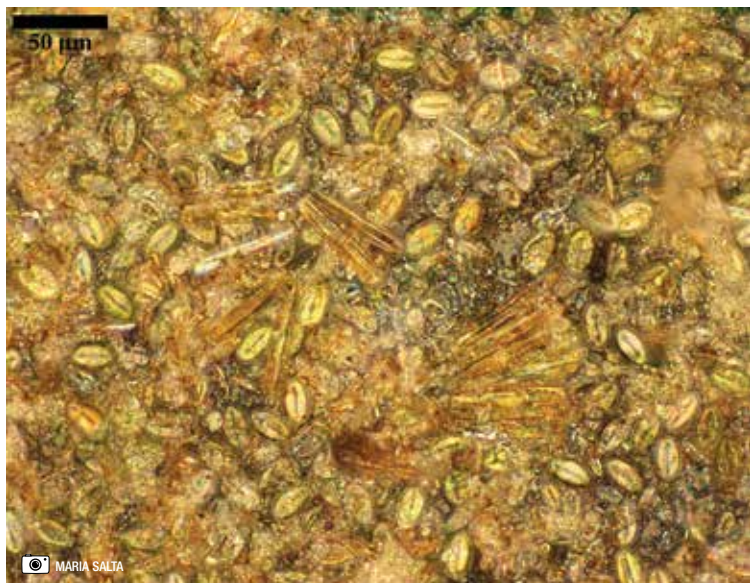
In-situ microscopy showing natural biofilm (“slime”) in real-time colours formed on a plastic surface after a month. These biofilms can be as thick as a few hundred micrometres and can directly affect a ship's hydrodynamics by increasing its drag as it moves into the water.

Despite the wide range of promising natural products deriving from algae, they are becoming less effective models for bio-inspired antifouling technologies against biofouling. This is mainly because developing antifouling compounds from marine natural products is considerably restricted by the regulatory environment for chemicals in coatings. Also, secondary metabolites are complex molecules and the active compounds