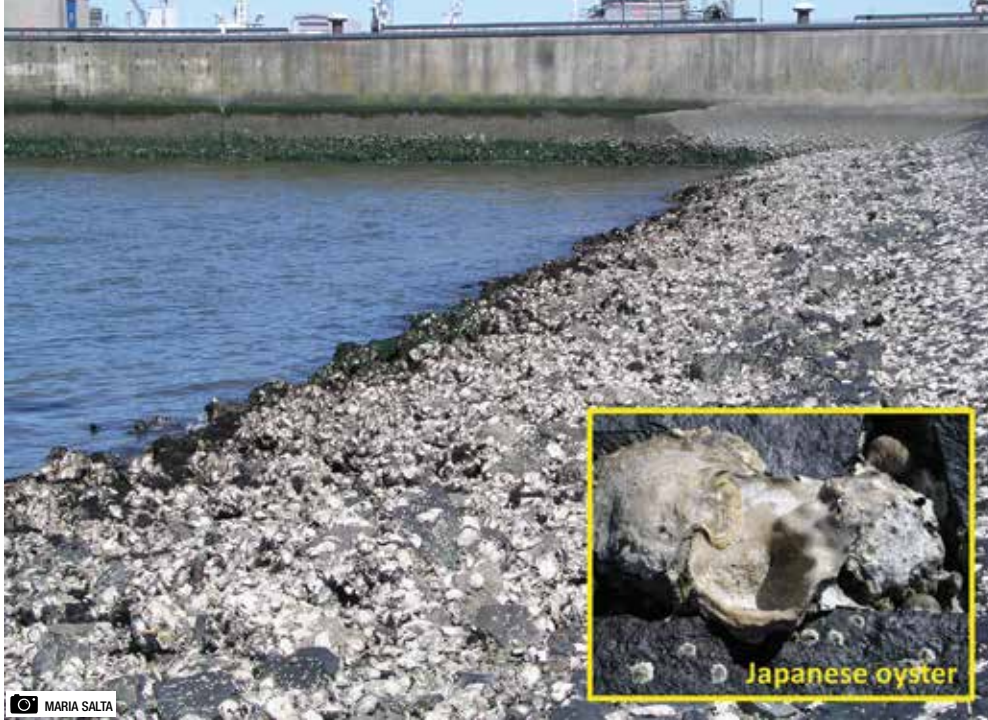
An example of alien species (invasive species) where the Japanese oysters have outcompeted the local species in Den Helder, Netherlands.

vessels has been achieved through the use of organotin systems, with a durability of around five years. Their use, however, has become a major issue since the breakdown products of tributyltin (TBT) in seawater were identified as inducing serious biological damage to marine invertebrates. This impact on the environment resulted in the application of TBT paint systems being completely banned by the International Maritime Organization in 2008. As a consequence, considerable international effort has been devoted towards developing environmentally friendly technologies capable of providing the required degree of protection from marine fouling along with adequate coating adhesion and endurance.