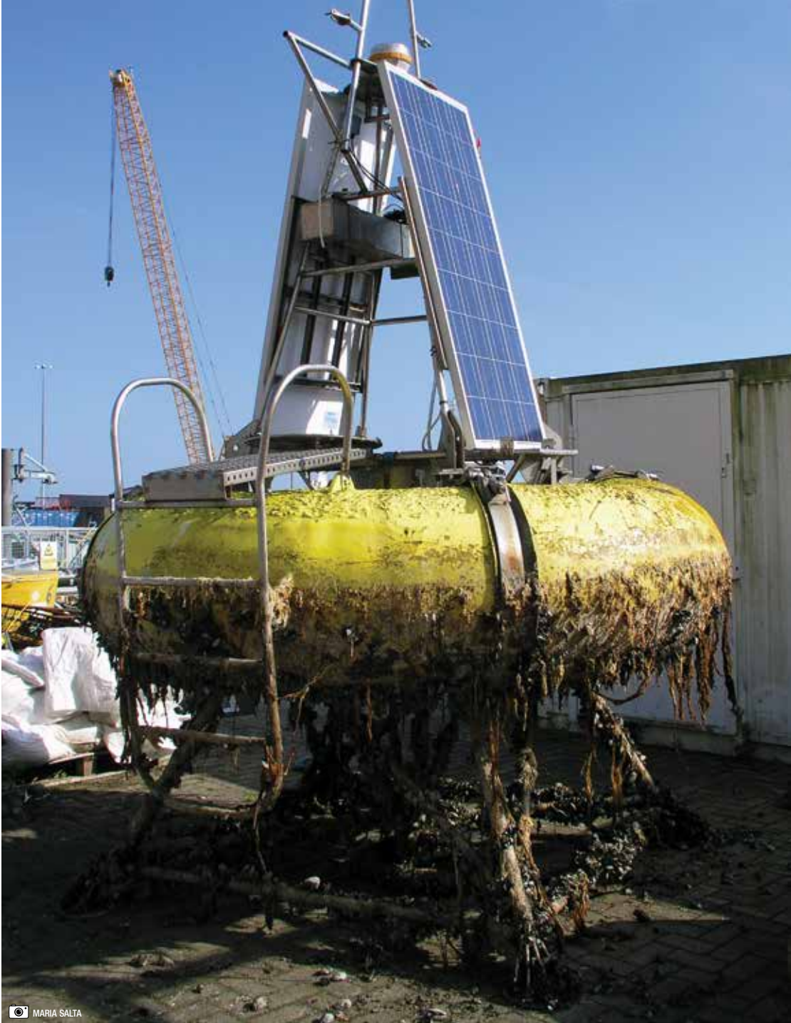
Example of biofouling growth on buoys that support instruments for oceanographic work.

inspired by the shark's skin, named Sharklet AF™, was achieved by designing similar patterns using silicone (polydimethylsiloxane) at a variety of sizes that were scaled down from the ones found in nature. Interestingly, some of the designs managed to reduce barnacle larvae settlement by 97% and spores