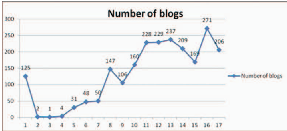
Figure 1. Tendency of Sina.com micro blogs sent by U.S. Embassy in China. Note: 1-17 indicates each month from May 2010 to September 2011

important officials, guide of visa policies, etc.; 2) Speeches of important U.S. officials, including full text of speeches delivered by the president, vice president, Secretary of State and ambassador to China as well as live videos or records from time to time; 3) Introduction to domestic policies and administration of the United States, including topics mostly concerned by Chinese netizens, e.g. public budget, education policies, introduction to U.S. governmental agencies, etc. 4) Introduction to U.S. justice system and procedures, relevant law cases, principles and development of U.S. justice and democracy; 5). Introduction to American cultures, including English learning, places of interest, literature, history, science and technology, master minds, education, progress of civil rights and other relevant cultural topics. Table 1 shows an example of different micro blogs posted by the U.S. Embassy in China.