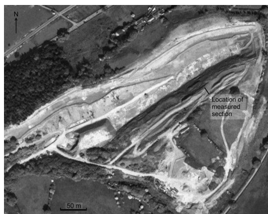
Fig. 1. Aerial photo of Buttington Quarry, showing location of measured section.

Buttington Quarry (previously known as Buttington Brick Works/Pit, when the Telychian Tarannon Shales Formation was being extracted from here for brick making) lies approximately 4 km northeast of Welshpool, Powys, Wales. The Ordnance Survey grid reference for the quarry is SJ 265100. Locality maps are provided by Loydell & Cave (1993) and Mullins & Loydell (2002); an aerial photo of the quarry as it appeared at the time of the main phase of sample collection is provided as Fig. 1. The quarry exposes a 275m + thick sequence of near vertical lower Silurian strata, younging to the southeast, with a strike of 055°.