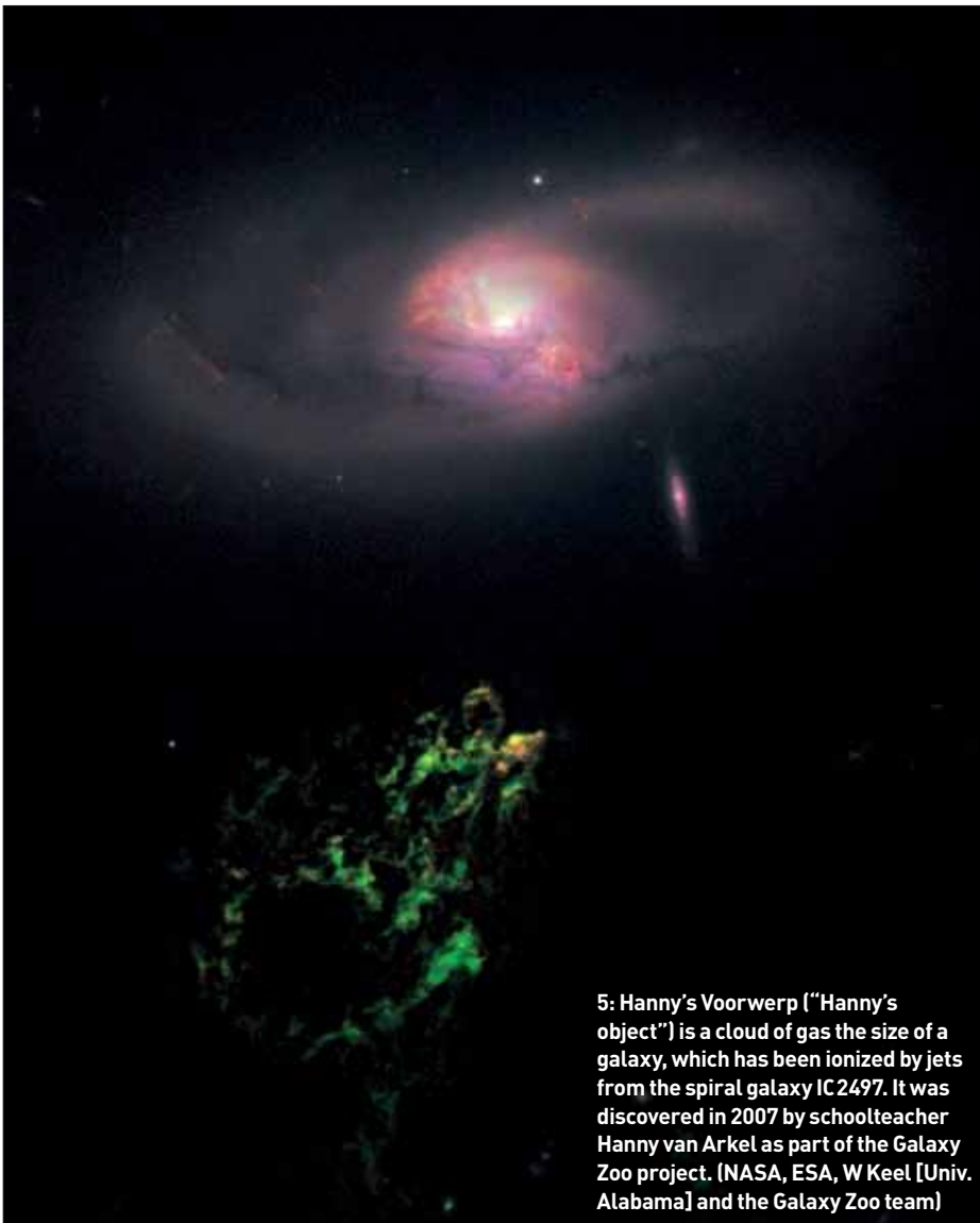
5: Hanny's Voorwerp ("Hanny's object") is a cloud of gas the size of a galaxy, which has been ionized by jets from the spiral galaxy IC2497. It was discovered in 2007 by schoolteacher Hanny van Arkel as part of the Galaxy Zoo project.

from the Galaxy Zoo sample of nearly 900 000 systems. One of the biggest successes of the Galaxy Zoo project has been the serendipitous discovery of truly unusual objects, an area highlighted by Chris Lintott (University of Oxford) who spoke about what we can learn from light echoes of AGN. The first of these extremely rare objects was found by Galaxy Zoo volunteers and dubbed Hanny's Voorwerp (figure 5; Lintott et al. 2009). This object has been shown to be a galaxy-scale gas cloud highly ionized by jets associated with AGN activity in IC2497, a neighbouring infrared-luminous disturbed spiral galaxy. However, X-ray and infrared observations have established that IC2497's current AGN luminosity is insufficient to account for the Voorwerp's appearance. This suggests that a drop of at least an order of magnitude in AGN luminosity has taken place within the past few hundred thousand years in IC2497. Inspired by this discovery, Galaxy Zoo volunteers had found more examples of AGN-ionized gas clouds (Keel et al. 2012), which have been the subject of an extensive HST programme. Of the 19 studied in detail, it is exciting to note