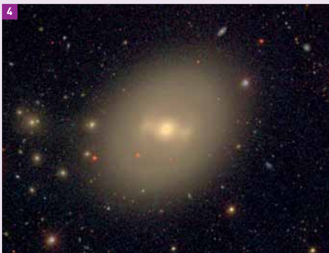
4: What looks like a bulge at the centre of NGC 936 might actually be part of the bar.

common in more massive, redder and less star-forming disc galaxies, as we shall see below.