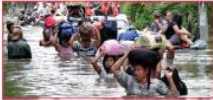
Victims of flooding at Orissa, India in 2011