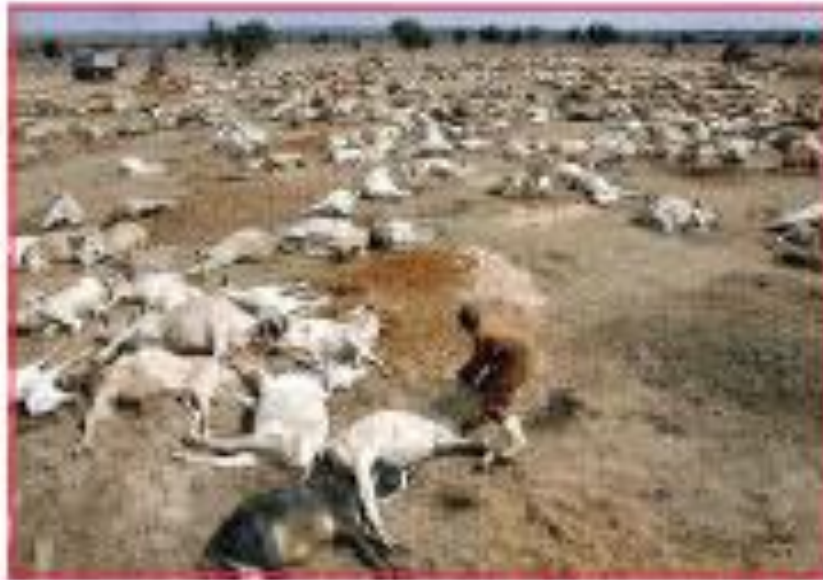
An epic drought killed livestock in Kenya and Ethiopia in 2011

United Nations Environmental Programme (UNEP) reported that as many as 50 million people could become environmental refugees by 2050 if the world did not act to support sustainable development (Tolba, 1989).