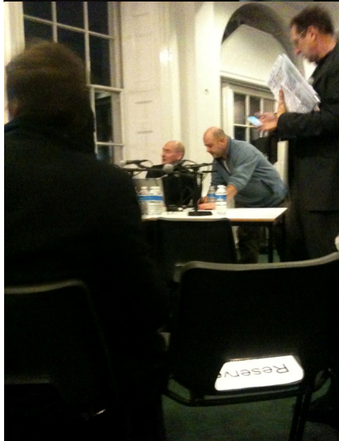
Figure 2: Rem Koolhaas at the Architectural Association participating on a round table about the book Project Japan: Metabolism Talks... Photo: Fabiano Lemes de Oliveira (07/02/12).