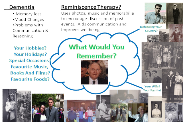
Figure 1. Reminiscent Therapy for Dementia

Recent statistics from the Alzheimer's society state that there will be approximately one million people diagnosed with Dementia in the UK by 2021 [6]. This debilitating syndrome strips people of their precious memories which have accumulated over time. Reminiscent therapy (RT) however, is a popular method used in promoting positive mood and well being and reducing the sense of feeling alone for people with dementia (See Figure 1). It involves using meaningful prompts, including photos, music and recordings as an aid to remembering life events [4]. Some research states that it has been useful in reducing depression [7]. Whilst it has been predominantly utilized in people with dementia, there could be scope for applying this theory in other mental health conditions where depression and general low mood are common. This could potentially induce a 'self soothing' process which could lend itself well to people who struggle with day to day living as a result of low mood.