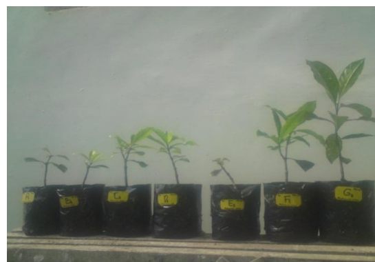
Figure 1. The difference of seedling growth of Antherura rubra Lour at 16 WAP

There are no significant difference of A. rubra seedling height between the treatment with natural compost media, the treatment using natural compost with addition of various dosages of fertilizer katalek compost and katalek compost with one dose of fertilizer. This was occur because the influence of the C/N in both of compost media.