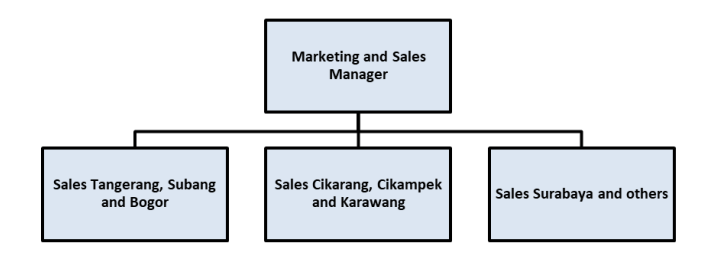
Fig 5. Sales Force Organization

In interacting with potential customers or customers, sales force start-up company provides the best customer service, way of work, attitude, speech and action to prospective customers or customers. Good service to customers is a good promotion for Start-up Company. As a company engaged in services, word of mouth promotion (word of mouth marketing) can only be achieved if customers get a satisfactory experience of the services offered by Start-up Company.