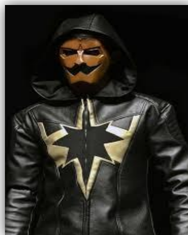
Figure 11. Modern Concept of Gatotkaca by Charles Gozali