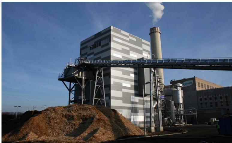
Figure 1 – Small biomass power plant

As we mentioned before, it is possible to reduce local electricity prices, lower electricity transmission losses, lower heat prices and to process waste product from agricultural production and from forestry. In this chapter, we will present a fictional case study for such small city, which decided to increase biomass utilisation.