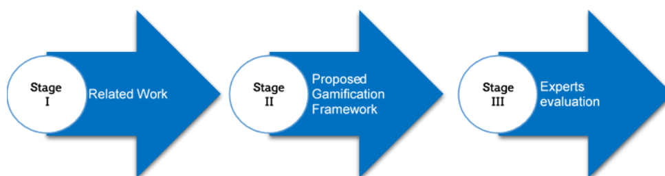
Figure 1. Research methods

The study consists of three stages; the first stage is to review the various MOOC platforms that use gamification to get an overview that has been done by previous researchers. The next step is to formulate a gamification framework based on approaches that are considered appropriate. Whereas at the last stage is evaluating the proposed model through the assessment of experts. This research stage shown in Figure 1.