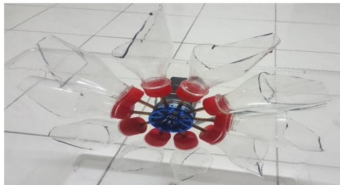
Figure 4. Hardware design of turbine

The generated voltages for each different number of blades were recorded by turning on the ball valve for 100%. The height of the tank is placed at 65 cm and water level in the tank is maintained for all the testing. The designed hardware for the turbine is shown in Figure 4, while the result of the voltage output and number of blades from 2 to 10 blades were recorded in Table 3.