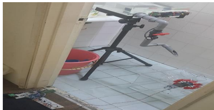
Figure 3. Experimental Setup

To identify the optimum efficiency of the system, 3 test were conducted. The explanation for the each of testing and figures will be shown. Each of the test results will be analyzed by providing data in the form of table and graph. All tests are carried out for the hardware system of the design. Figure 3 displays the experimental setup.