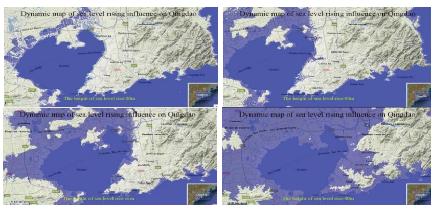
Figure 5. Dynamic map of sea level rising influence on Qingdao

Based on the above constructed symbolic dynamic expression model, we adopt the key frame algorithm to select and process the key frames to better balance the visual effects and the amount of data of the dynamic map. And the effect of partial the dynamic maps produced is shown as follows.