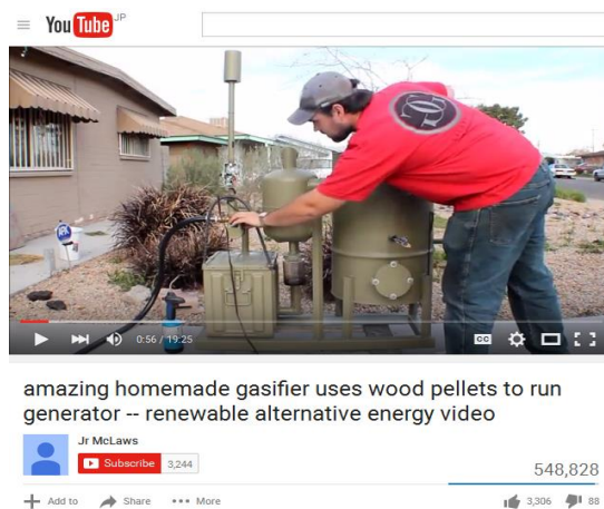
Figure 3. Typical YouTube video with the views count and like-dislike expression

Nevertheless, such an informative and communicative video was not necessarily created in a well-equipped studio where every single detail of the recording process is professionally well-prepared. As the engagement performance, the video was viewed more than 900,000 times and attracted more than 900 comments (as of May, 2018). Some of the comments contained technical discussions, suggestions related with the know-how, criticism on the selection of technology, as well as appreciation for creating and sharing the video including the detail explanation. The video and question or comment in the comment list has both a thumb up (meaning of I like this) and a thumb down (meaning I dislike this) signs adjacent to Reply sign to facilitate the simplest form of engagement on YouTube. As the video received more than 7,000 thumbs up and only less than 250 thumbs down (as of May, 2018), the was assumed to attract more positive impressions rather than negative ones. Moreover, following the people engagement in the comment list of the video may also enrich public knowledge on the renewable energy technology, particularly biomass gasification technology.