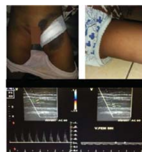
c. Doppler ultrasonography 8 days after thrombolysis and left lower limb after 60 days.