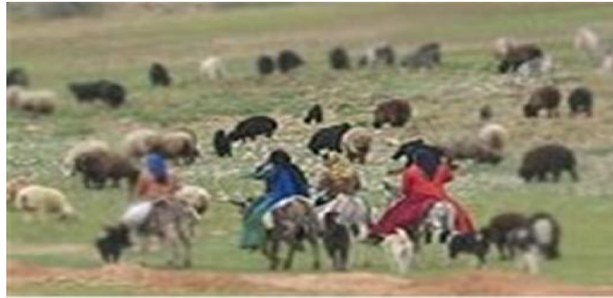
Picture 2. Nomadic tribes' life style