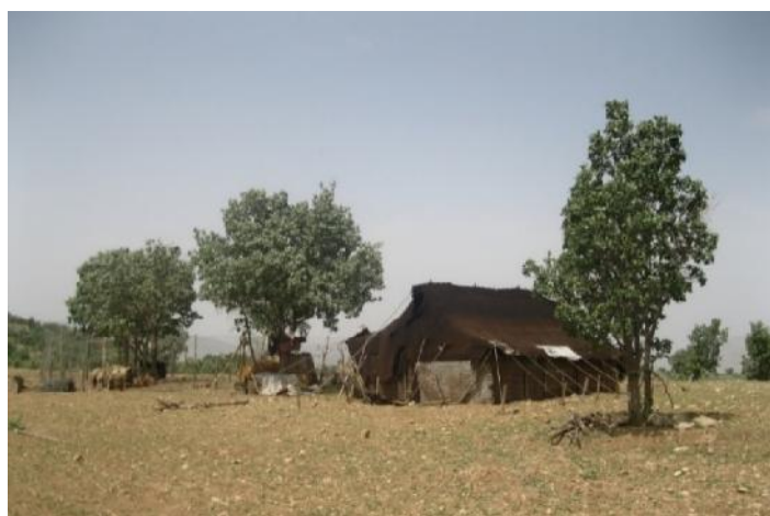
Picture 1. The lifestyle of Nomadic Tribes in Ivan Kalhor, Iran

Generally, in the present study, the researchers just considered to the cooperation that performed in nomadic tribes in west of Iran. In truth, they wanted to reveal Iranian culture and relationships in nomadic tribes' area (Ivan Kalhor, Iran). Likewise, in the current study has been shown some real pictures in nomadic tribes of Iran for making clear their situation and life style. Picture 1 shows the lifestyle and condition of nomadic tribes in Ivan Kalhor, Iran.