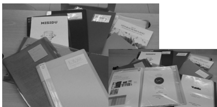
Figure 2: Physical evidence of participative observation

Picture 1 portrayed the process of a semi-structured in depth interview to some informant of the research. As for the participative observation was documented in the archive of consultations or guidance for each business project that were done by the students themselves (Picture 2).