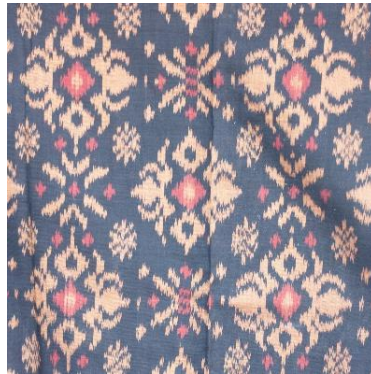
Figure 2. Endek

Figure 2 in this research, the data used is Endek images taken with RAW format. The advantage of using images with RAW format is the uncompressed image file, thus storing more information when compared to the compressed image file. Images were taken at three locations in Bali, namely CV. Artha Dharma located in Buleleng, Agung Bali Collection located in Bangli, and Pengrajin Sri Rejeki located in Klungkung.