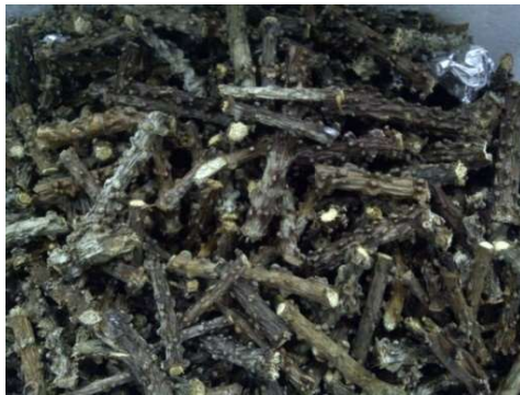
Figure 1. Died TC stem

TC barks were obtained and determined at Jubli Perak Farm Park, Malaysia. Samples are cut into 2-3 cm sizes and then dried at 40°C for 5 days. The dried samples were then mashed into powder. The powder was soaked in 1:10 water in a 60°C water bath for 6 hours. The mixture was then filtered and lyophilized for 5 days to produce 2.08% (w/w).